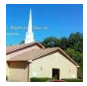
Indianapolis, IN - Senior Pastor -Little Bethel Missionary Baptist Church

Antioch Baptist Church of Bedford Hills, New York, announces a pastoral opening, effective September 1, 2014. We are seeking a full-time pastor to be spiritual leader of the congregation...Antioch is a small church with committed and dedicated members who make it possible for us to prayerfully set and reach "large church goals." We can do all things through Christ who strengthens us. Philippians 4:13.